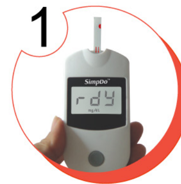
1 Insert the test strip to the monitor

The SimpDo™ blood glucose monitoring system is designed for in vitro diagnostic use only, intended for the quantitative measurement of glucose in fresh capillary whole blood. It is suitable for home or professional use.