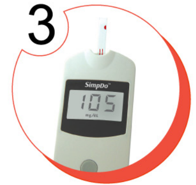
3 The result (in mg/dl or mmol/l) appears in 30 seconds